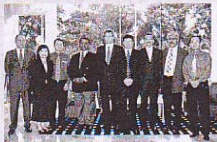
ExCom of FBBA

In the true spirit of FBBA is wishing the Muslim Community, "Selamat Hari Raya" still... The International Community, " Merry Christmas & Happy New Year" and the Chinese Community, "Gong Xi Fa Cai"