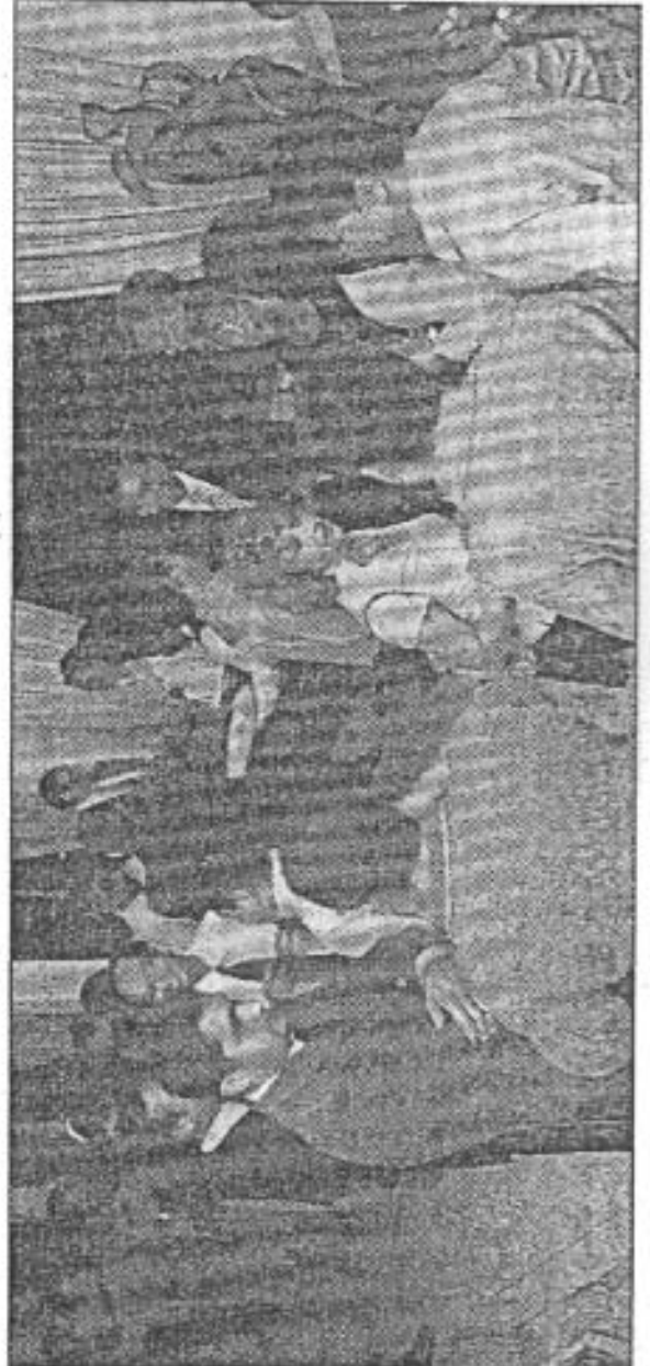
New and old members mingle at the reception